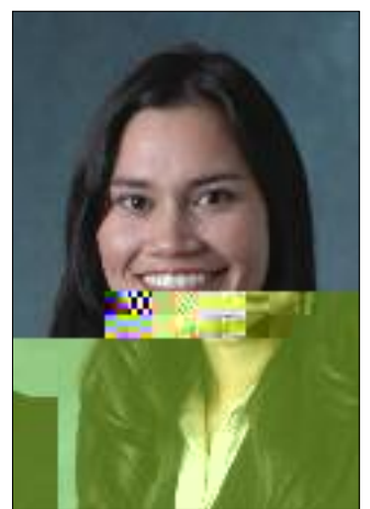
ancisca nt an

Until recently, empirical research on the economic effects of international migration focused mostly on outcomes for the destination country or for the migrants themselves. This research overlooked the fact that migration often involves family separation, and thus neglected to examine another important group affected by international migration: the family members that migrants leave behind in the home country. The tacit assumption was usually that migration would only have been undertaken if it had been the optimal decision for the entire family,